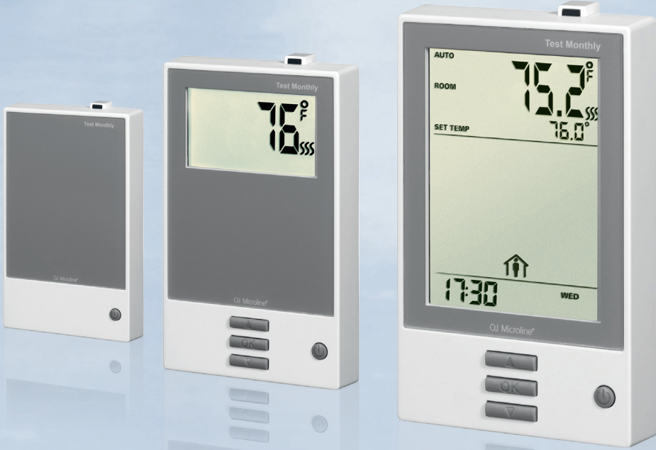
The intuitive OJ Microline® series contains 3 variants